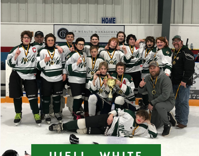
U15LL - WHITE