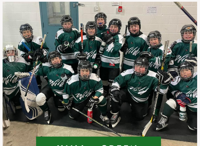
UIILL - GREEN

Congratulations to the UIILL Green (sponsored by Sparlings Propane) for great Tournament play at the Coldwater Classic Saturday January 13th! The team played the Coldwater Wildcats (10-2 win), the Almaguin Ice Devils (3-0 win) to earn their spot in the Championship game against the Coldwater Wildcats. The team played a great tournament however had a tough loss of 5-4 to the home team in the final.