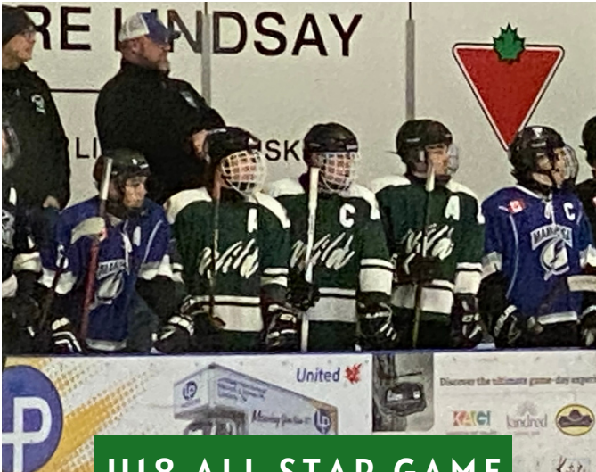
U18 ALL STAR GAME