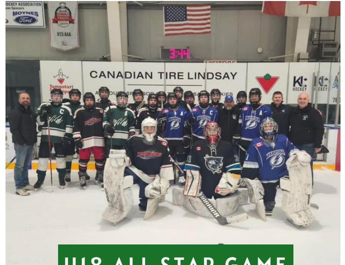
U18 ALL STAR GAME